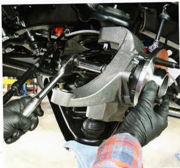
Once the spindle is installed, it's a simple matter of installing the sealed bearing hub by torquing the three fasteners to spec. No grease, no packing bearings, no guessing on the spindle nut torque.