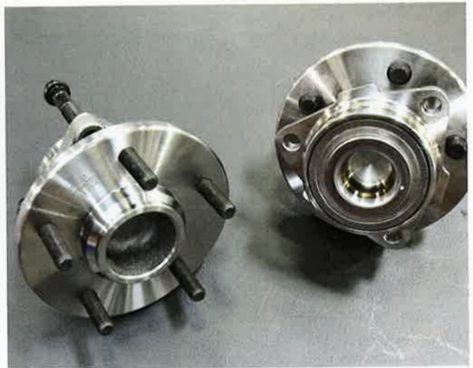
... instead of relying on those small bearings and a vulnerable axle pin, the X10 spindles utilize a sealed bearing hub based on late-model, full-sized GM pickup trucks.

and sought to develop a solution. They've had a proven design in their Modular drop spindle for years, but as the brake kits and wheel/tire combos grew larger, they started to turn their attention to developing a more modern spindle and bearing design. Enter the X10 spindle.