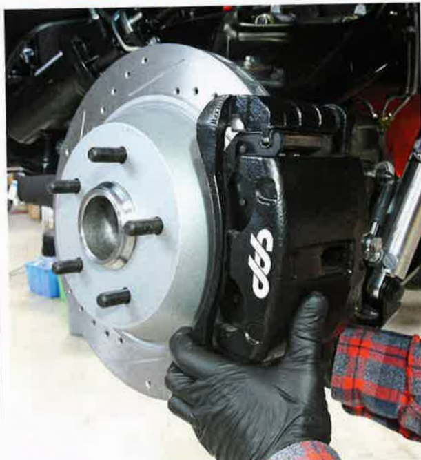
With the hub in place, any brake kit that fits CPP's Modular spindle can be installed. Here, we're reinstalling their 14-inch Big Brake kit that was previously used on our C10 to showcase the simplicity of the spindle swap.