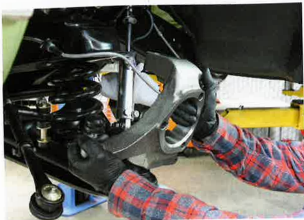
Installing an X10 spindle with the appropriate ball joints in place, however, is a simple affair.