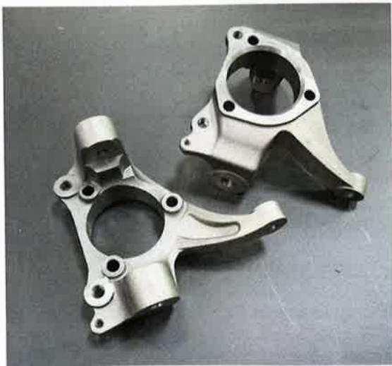
CPP's X10 spindle shares the same dimensions as their popular Modular 2-1/2-inch drop spindle with one huge caveat ...