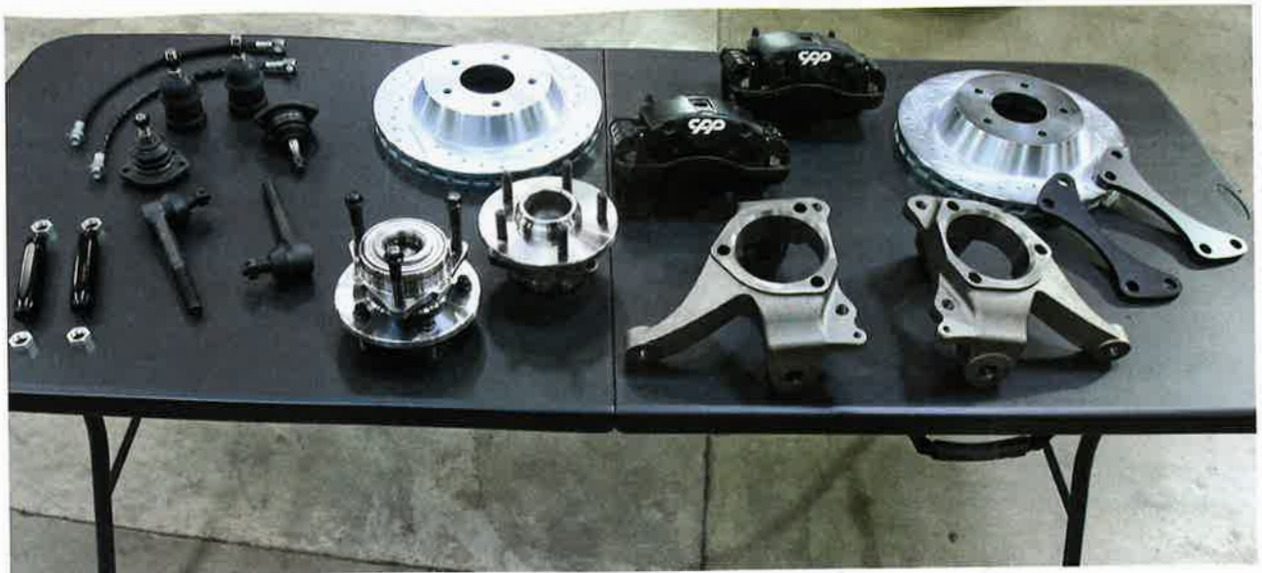
Here's CPP's full X10 spindle setup, as required for the early drum brake C10 trucks. It consists of a pair of X10 spindles and hubs, late-model upper and lower ball joints, outer tie-rod ends, and billet conversion sleeves. Also pictured is CPP's 14-inch Big Brake Kit as an additional upgrade option.