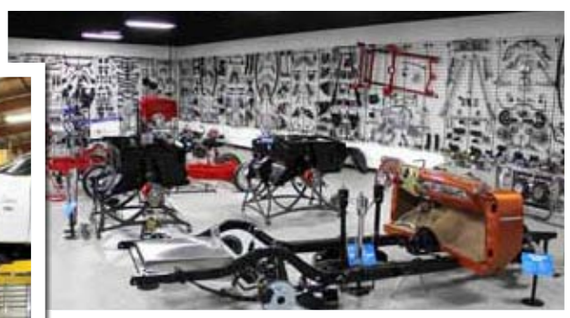
Our new Placentia showroom displays thousands of our products.