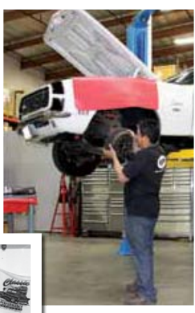
The new CPP Tech Center allows us to test new products on vehicles to ensure quality and fit.