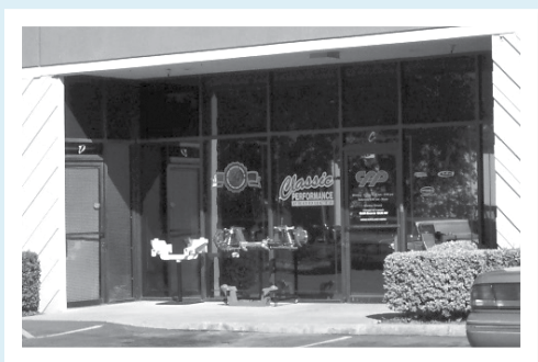
CPP's first storefront located in Buena Park, circa 1995

As we move forward into our 22nd year of business, we have not forgotten where it all began....building quality parts at an affordable price for our customers.