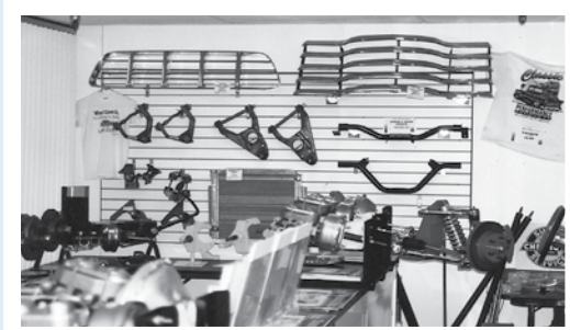
In the early days, CPP's first showroom and front counter.