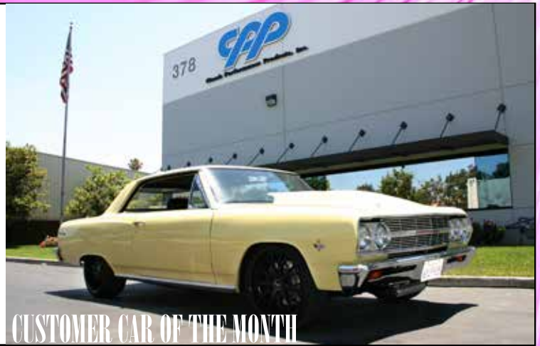
CUSTOMER CAR OF THE MONTH

If you are in our area in your classic car, let your CPP salesman know at the counter so we can take some photos. We will be featuring customer cars all year long.